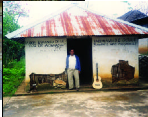
The new church is twice the size of the old church (inset), and was built on the same spot.